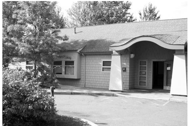
Greater Lakes looks forward to opening its new evaluation and treatment facility in 2010.

OptumHealth Pierce RSN has chosen a combination of for-profit and non-profit vendors to provide elements of county-wide crisis services to replace those provided by Pierce County Health and Human Services prior to October 1, 2009. Greater Lakes was selected to provide a 16-bed inpatient Evaluation and Treatment facility. We are acquiring a vacant Parkland facility formerly owned and operated by Good Samaritan Outreach Corporation as a geriatric clinic and respite center. Our new Orchard Hill Evaluation and Treatment Center will be located at 140th and "A" Streets. Fast-track plans are underway to remodel and expand this facility for both voluntary and involuntary short-term inpatient mental health treatment. We plan to launch a portion of these services in early 2010.