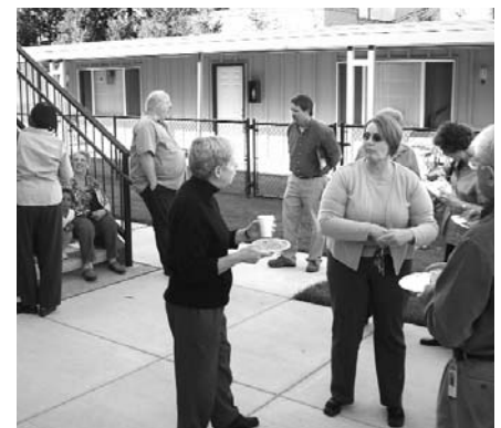
The Cedars is located adjacent to Spanaway Commons