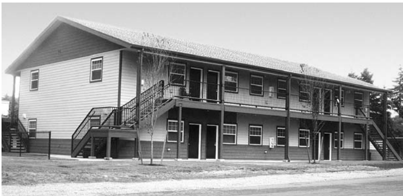
Spanaway Commons is located on 170th Street So. in Spanaway

Our newly-constructed Spanaway Commons building opened on July 1, 2009. Greater Lakes built this 16-unit apartment complex with a combination of funding from the U.S. Department of Housing and Urban Development, the Washington State Housing Trust, and the Pierce County Department of Community Services. This building is part of a "housing first" program to provide homes for chronically homeless adults with mental illness. It complements two other Greater Lakes housing facilities on the same site, The Cedars and Independence Inn. In the photo of the September Open House of Spanaway Commons, The Cedars, a single-story 16-unit apartment building, is visible in the background. On the east side of the property is Independence Inn, a 13-bed Adult Residential Treatment Facility, staffed around the clock for consumers who need more intensive services.